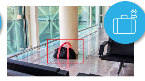
Abandoned object detects objects placed within a defined zone and triggers an alarm if the object remains in the zone longer than the user-defined time allows.