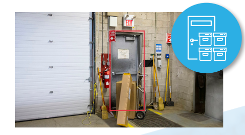
Blocked exit detection helps businesses stay compliant with fire and safety regulations by sending real-time notifications when exit pathways are blocked.