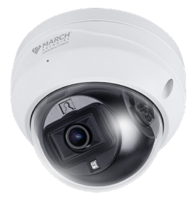
CS5 Indoor Dome