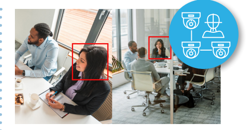
Re-search Match the person of interest across different cameras to track their presence in the entire surveillance system.