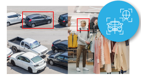
Attribute search Use People and Vehicles as search criteria utilizing multiple attributes (e.g., gender, age group, clothing or car color, vehicle type) to quickly find the person / vehicle of interest.