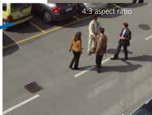
A standard D1 resolution image overlaid on a MegaPX 720p MiniDome image (1280x720)