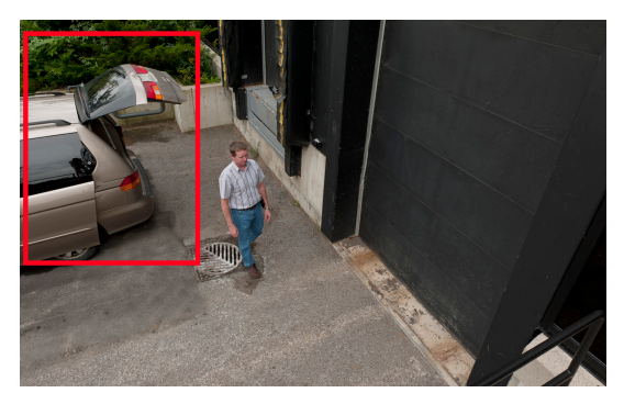
The "Loitering Detection" analytic triggers an alarm when a person or object lingers in a particular area for too long.

Rugged 4MP IR bullet camera with built-in video analytics and HDR technology