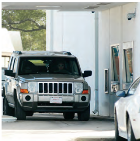
Vehicle approaches drive-up ATM

A business unit of Tyco (NYSE: TYC), Tyco Integrated Security is North America's leading commercial security systems integrator, providing security and business optimization services to more than 500,000 customers. Headquartered in Boca Raton, Florida, Tyco Integrated Security has more than 10,000 employees throughout North America. For more information, visit www.TycoIS.com