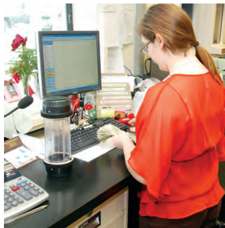
Teller counts out cash